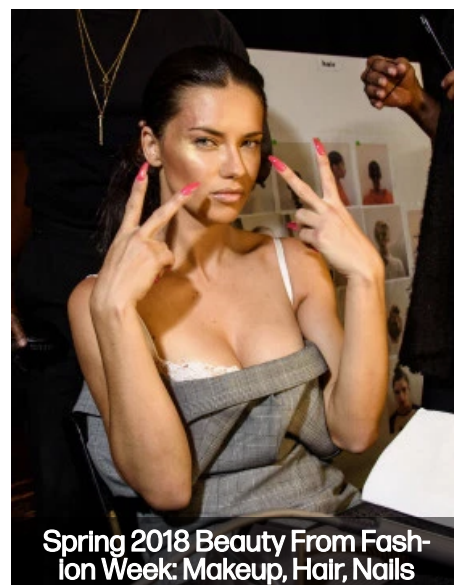
Spring 2018 Beauty From Fashion Week: Makeup, Hair, Nails