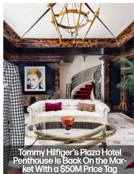
Tommy Hilfiger's Plaza Hotel Penthouse Is Back On the Market With a $50M Price Tag