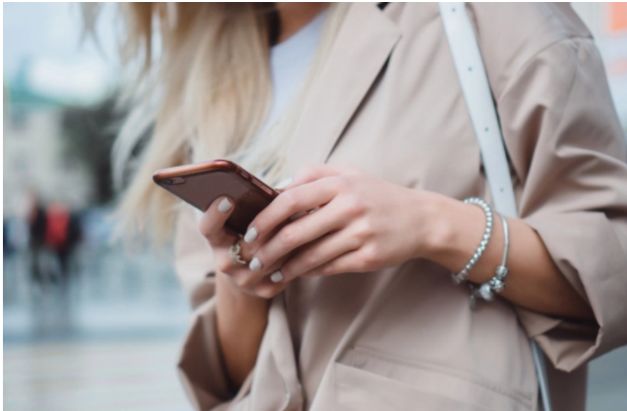
Apple iPhone.

Apple's getting ready to bring a new reality to the market.