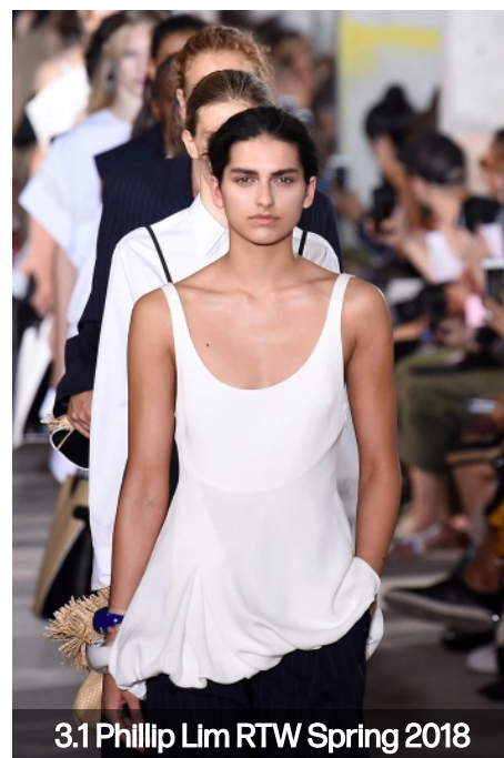
3.1 Phillip Lim RTW Spring 2018

Retailers — including Sephora, Toms, Neiman Marcus, Lowe's, Ikea and many others — need no convincing about the tech's promise. Sephora customers can try on virtual lipstick and other makeup, and furniture shoppers can fire up their phone cameras to see what an Ikea couch would look like in their real-world