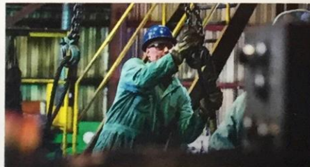
The opportunities and challenges presented to manufacturers by IoT